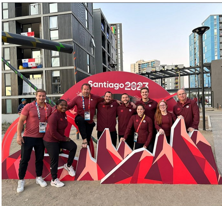
2023 Pan Am Games Team