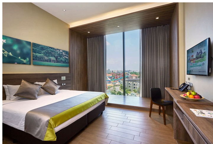
The D' Resort -Downtown East 5 star Hotel in Singapore